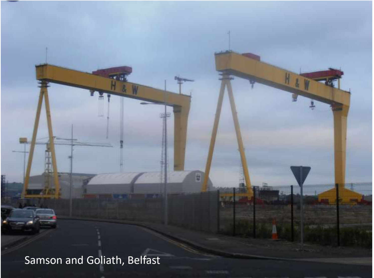
Samson and Goliath, Belfast