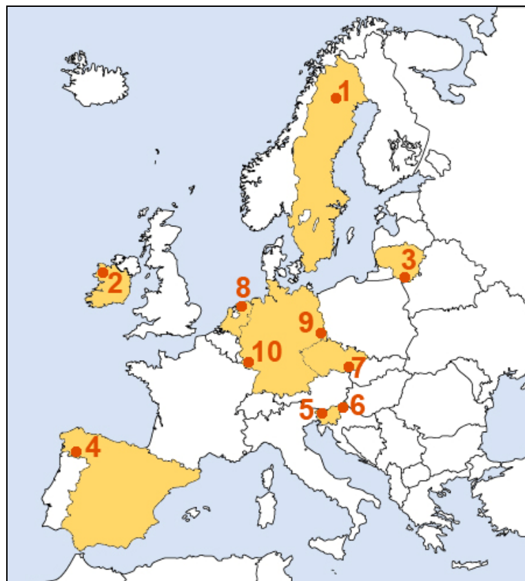
Figure 2 – Location of case study regions